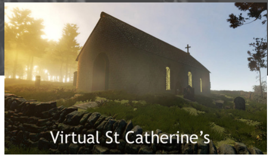
Virtual reconstruction of St Catherine's Church, Killybegs.

Donegal County Museum is collaborating with An Grianán Theatre and the Regional Culture Centre, Letterkenny on ‘Reimagine...’ an Irish Architecture Foundation project supported by the Creative Ireland Programme’s National Creativity Fund. ‘Reimagine...’ is a community-led architecture and design programme, which brings together local communities, architects, designers and planners to develop projects which will enhance the local built environment of each town involved in the project. The Letterkenny project LKCD.ie is being delivered by Pasparakis Friel Architects in consultation with Donegal County Council and is focused on highlighting and developing the physical linkages between the Museum, the Theatre and the Regional Culture Centre. It will include the installation of temporary way-finding markers and signage.