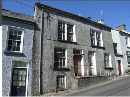
House on the Brae, Ramelton