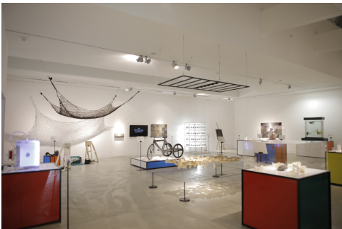
PLASTIC Exhibition at the RCC

This exhibition is free and suitable for all the family but booking is required. To book your guided tour visit here or ring (074) 912 9186.