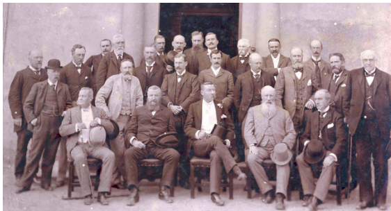
The last Donegal Grand Jury 1899.

The Grand Juries of Ireland are believed to have been in existence since Norman times. They were the predecessor bodies of modern local authorities and had a wide variety of public functions, including contracting out roads works; construction and maintenance of infirmaries, dispensaries, courthouses, schools and the County Jail; and collecting the rate ('county cess'). Diverse 'services' sometimes included translation of Irish, culling of certain animals and transportation of prisoners.