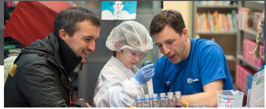
Science week at Bundoran Library.