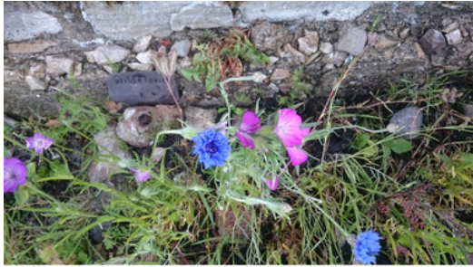
Artlink presents 'Signs of Biodiversity' at Artlink at Fort Dunree, Buncrana, on Culture Night

Culture Night, the all-island public event that celebrates culture, creativity and the arts, takes place on Friday, September 18th. In response to the restrictions posed by the on-going COVID-19 pandemic, this year's programme will be presented in both live and online events allowing for people at home and abroad to connect with Donegal culture.