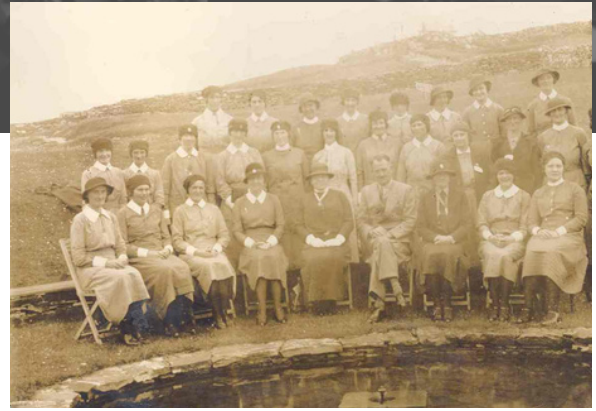
The Fanad Health Club committee, c1931, discussed in the Facebook presentation 21 Years 21 Archival Treasures.

The Donegal Grand Jury records include presentments (records of works to be done); accounts; minutes of meetings; correspondence and memoranda; also photographs of the last Grand Jury. They reveal much about life in 18th and 19th century rural Ireland. The original records are held at the County Archives in Lifford. The microfilms of the original records (and the catalogue) have been digitized and can now be viewed online at no charge. View the collection here .