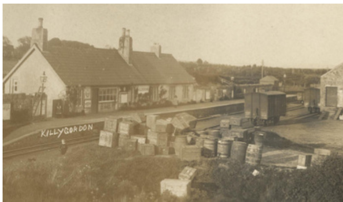
Killygordon Railway Station.

The Museum re-opened on Wednesday 26th August. We have worked hard to ensure a safe and enjoyable visitor experience and we are ready and waiting to welcome you back to enjoy our fantastic range of exhibitions. These include our new exhibition – The Railways of County Donegal featuring the images of A. M. Davies from the County Archives Collection, which are a poignant record of the final days of the railways in Donegal.